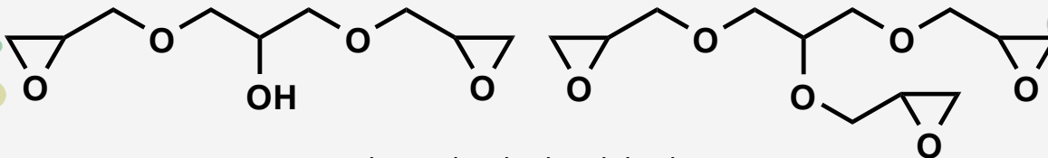
Glycerol Polyglycidyl Ether