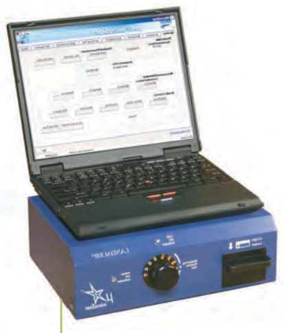
microStar portable reader and associated laptop computer