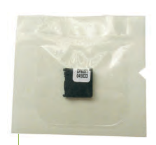
nanoDot in plastic pouch