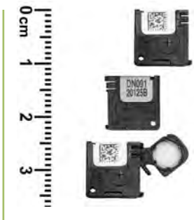
nanoDot Dot for single point measurement