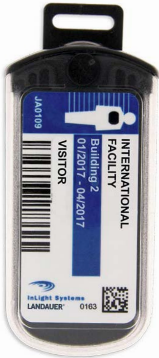
LANDAUER Holder Design